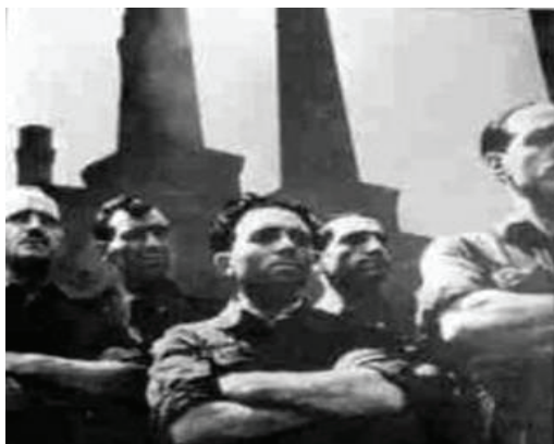
Striking Italian workers 1943