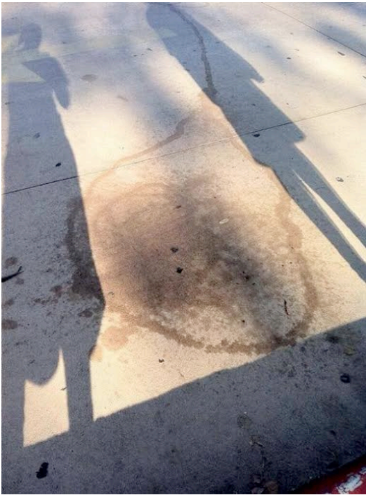
One month after the beating blood still stains the pavement

In the eighties these same Red Squads have begun to see their metamorphosis into “anti-terrorism” focused units largely carrying out the same functions against the same people. This is the other side of the police function of protecting and serving the capitalist class.