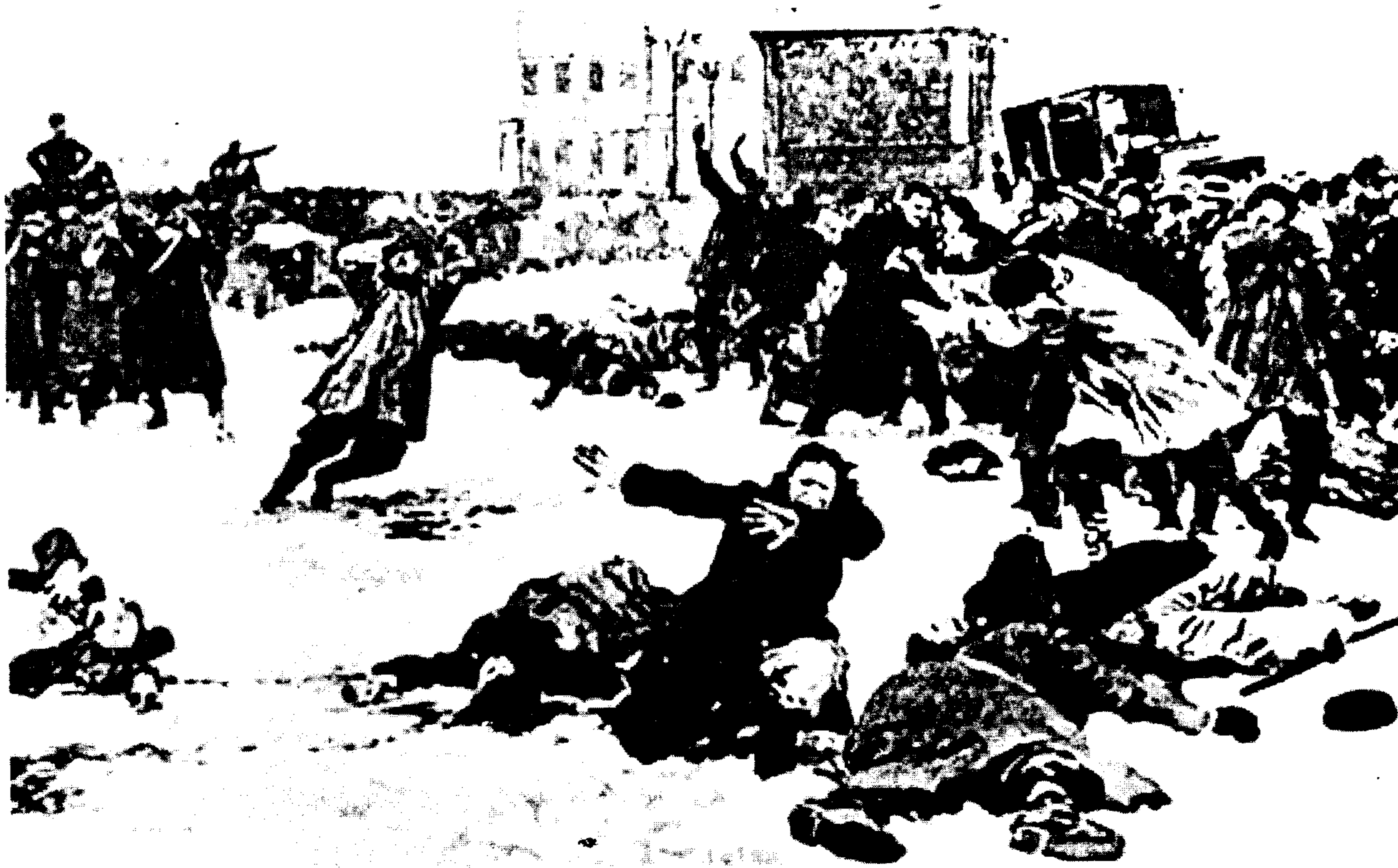
The scene in front of the Winter Palace, on Bloody Sunday, January 22nd 1905

Employers mainly conceded all the demands the workers put in this period, but often this did not end the strike as fresh demands were made. The fact was that the murders which had taken place in Odessa and elsewhere in previous struggles in the 1902-4 period were also now being avenged. There were so many strikes at this time that many went unreported. However, all the strikes remained economic. Rosa Luxemburg made a virtue of this spontaneity by arguing that this was because "revolutions do not allow anyone to play the school master with them". This is wonderful writing but