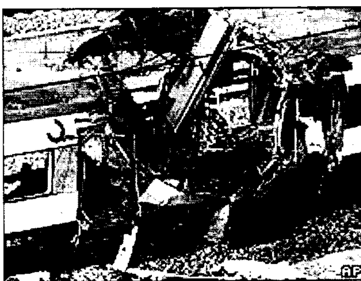
The Madrid bombings were a bourgeois attack aimed at mainly proletarian commuters

Southern Russia to organise White Armies (financed by the British and French) to do more than sabotage the Revolution. The proletariat tried to maintain principled opposition to the death penalty but from the very beginning their opponents went in for outright slaughter. In the takeover of Moscow the Whites massacred workers in the Arsenal and in the Kremlin and very soon the policy on the White side was to kill, sometimes by brutal torture (crucifixion included) every Communist that fell into their hands. According to Carr, though, on the Red side