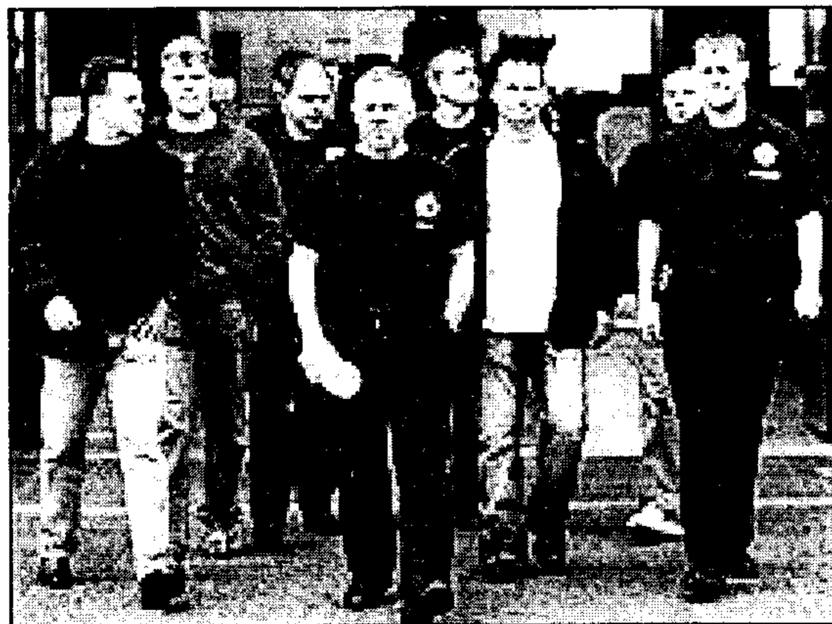
Salford fire crews were suspended for not taking on extra work before broken promises on pay were made good

There seems little doubt that the firefighters dispute was provoked by management who are desperate to shake up the whole fire service and turn it into an anti-terrorist/cheap ambulance service. They have been aided by the union which did its best to contain last year's militancy. The FBU was as scared as the management that this series of unofficial strikes spread so quickly they desperately stepped in to control the situation. Although they initially wanted to end the dispute the firefighters have rejected the agreement they reached and the dispute rumbles on.