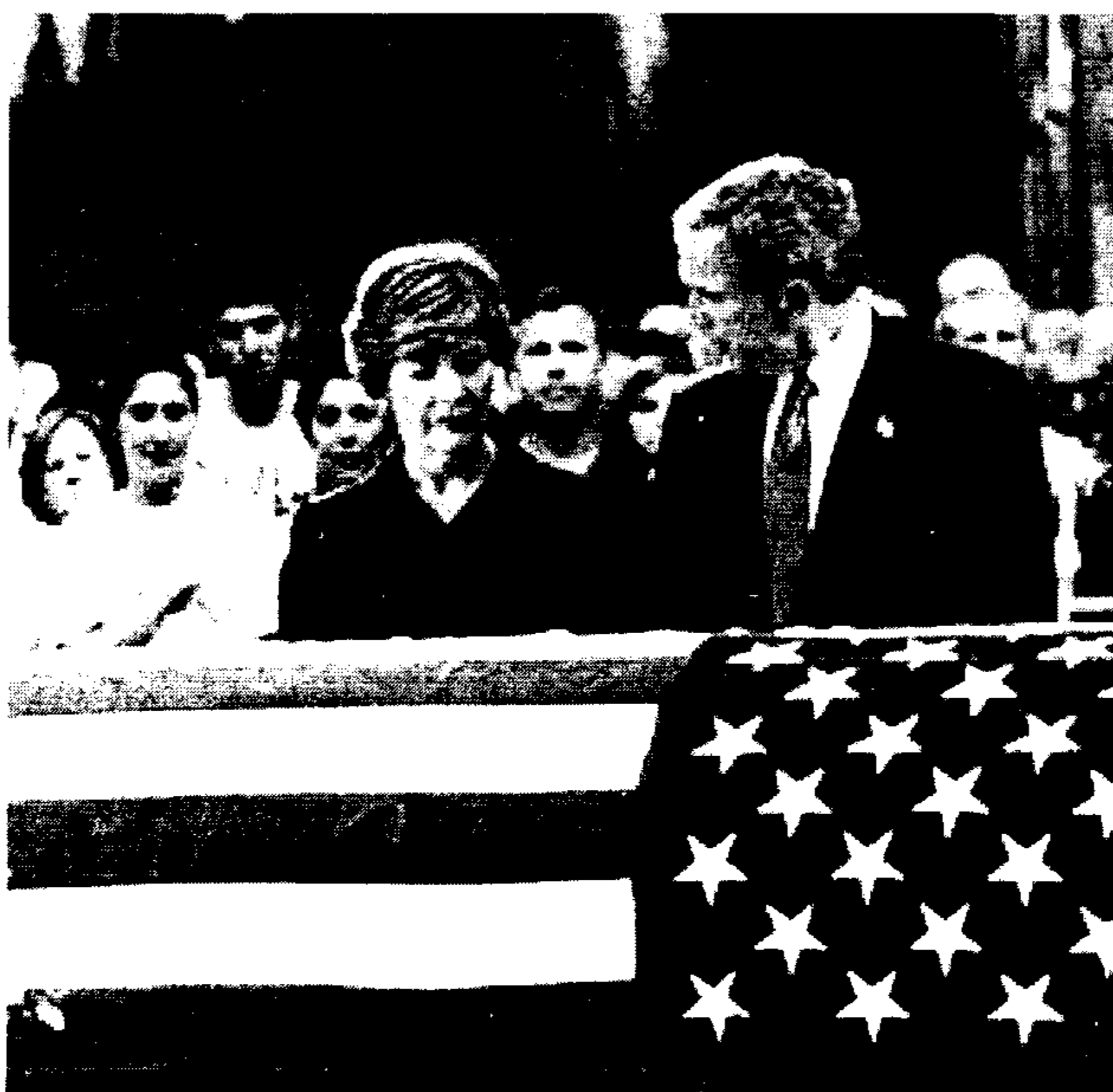
It is to be hoped that Al Qa'eda are mourning along with the American bourgeoisie. For, without the Reagan government's support, where would their organisation be?

was society struck indiscriminately to achieve the punitive objective. None of the seats of the Spanish government and no military structure was touched. It was the Spanish proletariat who was physically and psychologically hit. More than a thousand commuting workers and students, many of the latter children of workers, were the targets of Al Qa'eda .