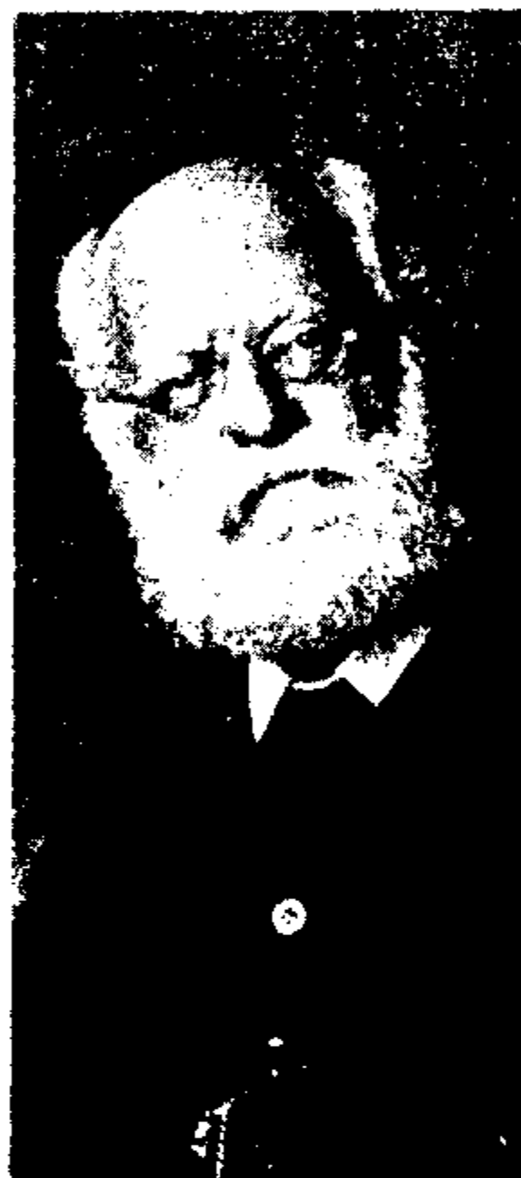
Karl Kautsky: The "Pope of Marxism" under Social Democracy he helped destroy Lassalleanism but only to replace it with a fatalistic approach which ultimately became anti-revolutionary and anti-Marxist

niary corruption, and asked for proof. The Jungen were a reaction to the downgrading of the preparation of the membership for the revolutionary struggles ahead in relation to those of electoral politics. In particular, they were repelled by people like Georg von Vollmar, who called on the SPD to renounce revolution and become a fully reformist party. But Vollmar did not share the fate of the Jungen, as his large following in Southern Germany made him immune to such treatment. The Jungen went on to form a new party, the "Independents" which then succumbed to anarchism and collapsed within two years.